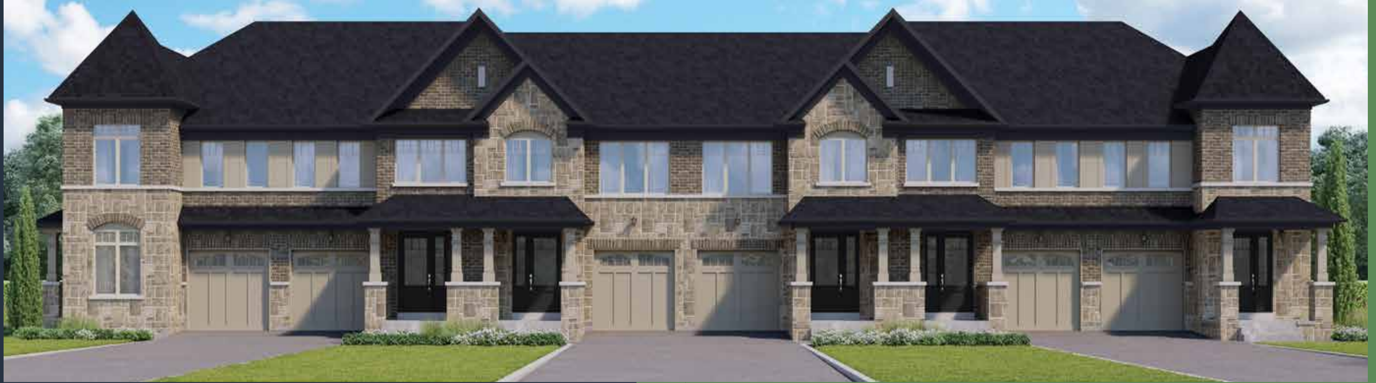
THE KENNEDY A4