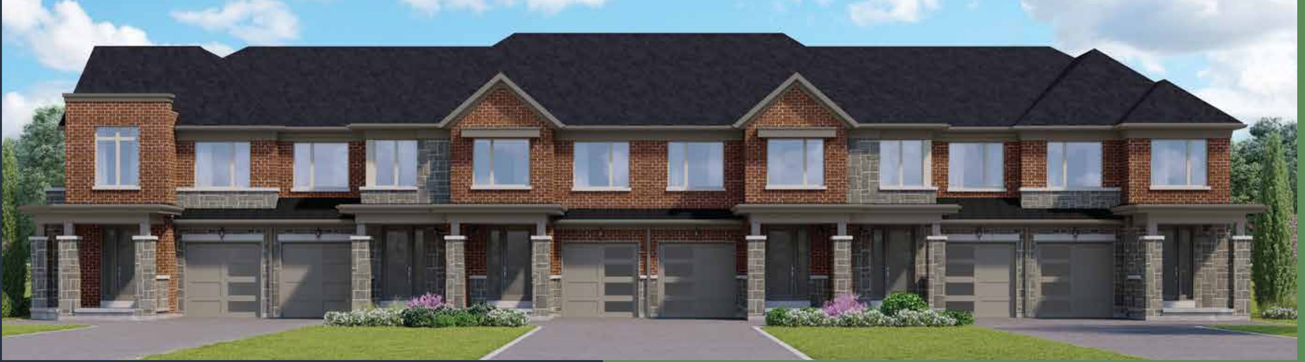
THE SULLIVAN B2 REV