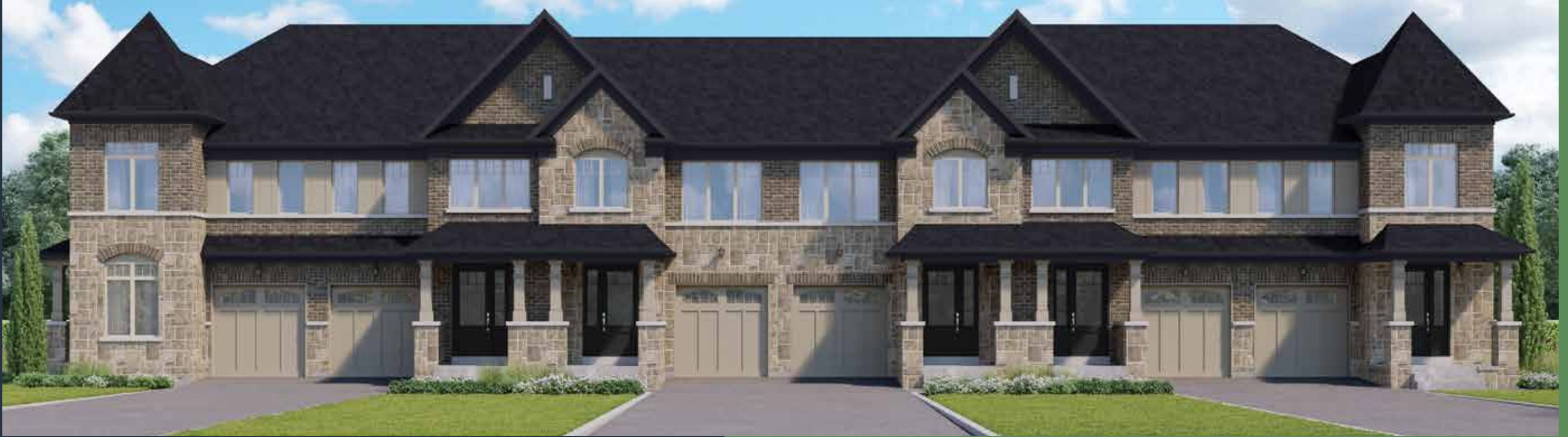
THE SULLIVAN A2 REV